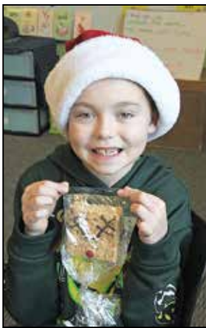
Before Christmas break, our students celebrated the upcoming holiday with games, snacks and crafts.